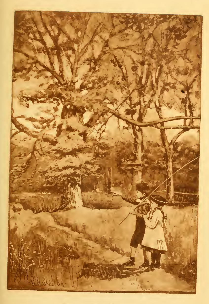
Buch the Home Sund